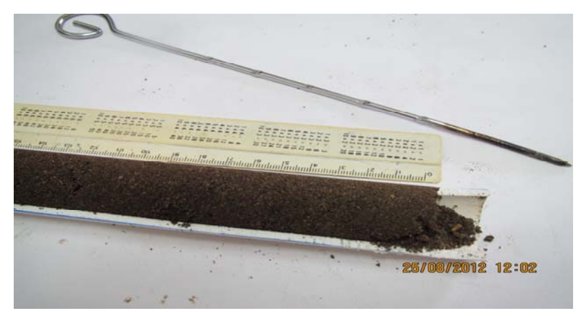
Plate 2: A method for evaluating the pupation depth of Zizyphus fruit fly

top of the soil, and covered with plastic sheet. Three replicates were prepared for each treatment. After 48 hours, the pupation depth was measured (Plate2).