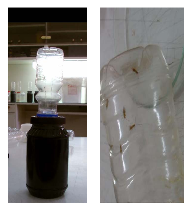
Plate 1: Parasite separator at the left side and emerged parasite attracted to the light at the right side.

To get pupae free from parasites for this trial, the stock of pupae were placed in a black jar connect with transparent plastic vial (plate 1). This unit was observed daily tell the emergence of parasite. The parasite was then attracted to the light in the transparent vial. Emerged parasites were daily released a way from the plastic vials. Adults from healthy pupae were usually emerged two days after the parasites emergence. After confirmation of complete emergence of the parasites, the remaining healthy pupae were selected and immediately used in the experiment.