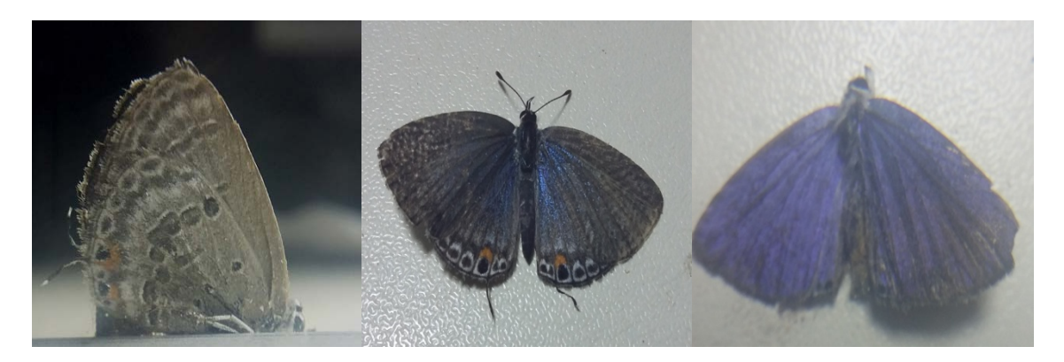
(a): Adult butterfly (b): Grayish brown colour (c): Blue colour of adult Photo (7: a,b,c) : Chilades pandava butterfly