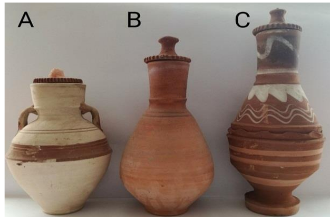
Fig. 2: Pottery jug (A), four of it purchased from Damietta Governorate; pottery jug (B) four of it purchased from El-Gharbia Governorate and Pottery jug (C), four of it purchased from El-Menya Governorate.