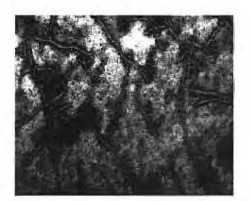
Fig. (2): Electron micrograph of partially purified ZYMV-Eg negatively stained with 2% uranyl acetate. (X-40,000).