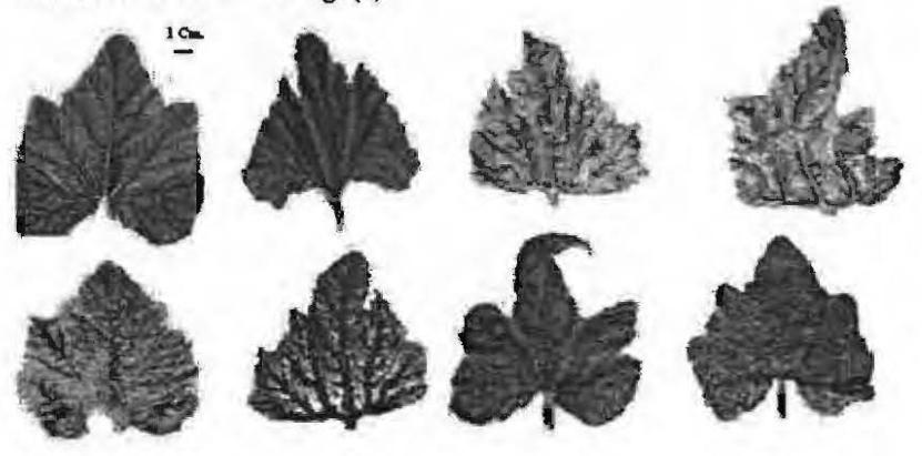
Fig. (1): External symptoms caused by ZYMV-Eg in C. pepo cv. Eskandarani

The presence of ZYMV in sampled leaves of zucchini squash was detected via DAC-ELISA with positive absorbance reading at 405 nm in the range of 0.181 to 0.319 while healthy leaf extract had reading of 0.090. The naturally infected leaves as well as the mechanically inoculated leaves developed severe mosaic, vein banding, chlorosis, yellows and crinkling Fig. (1). The electron micrograph of negatively stained partially purified virus preparations shows the presence of flexuous filamentous virus particles with dimensions 750 X 13 nm Fig. (2).