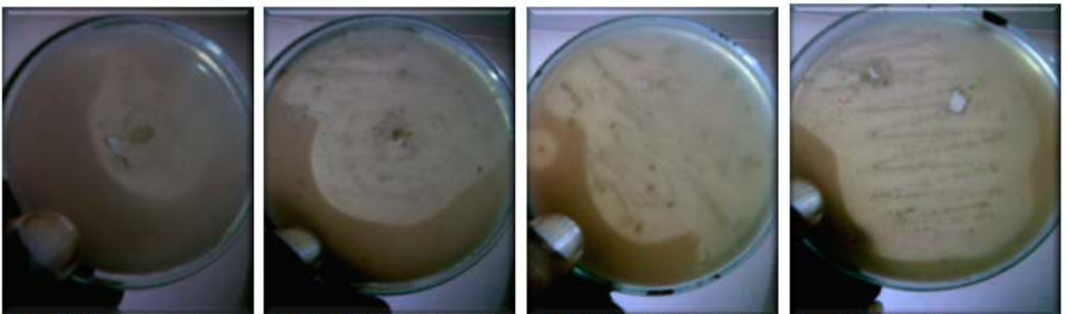
No.(4) After five days No.(5) After seven days No.(6) After ten days No.(7) After fourteen days