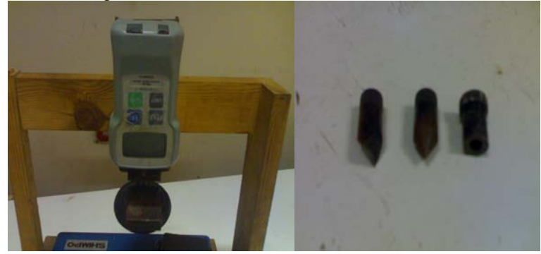
Figure (5): Digital hardness and shear force gauge.

Shear force was measured at both longitudinal and transverse axis. The conical end of the meter was changed to shearing edge (straight sharp edge), as shown in figure (5) and the previously mentioned procedure was used for measuring shear force at both seed axis.