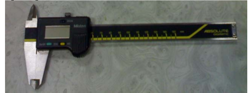
Figure (1): Digital vernier caliber

A digital caliper model (Mitutoyo DAG-500, Japan) shown in figure (1) with accuracy of 0.01 mm, was used to measure the principal dimensions of jojoba seeds length (L), width (W) and thickness (T) in millimeters and the average Length, width and thickness of 100 seeds were considered.