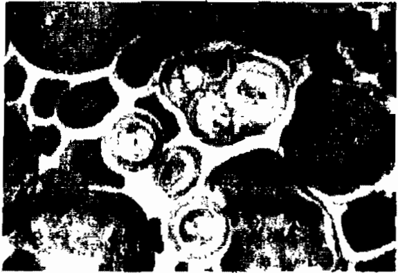
infested by large EMC in all musculature regions.