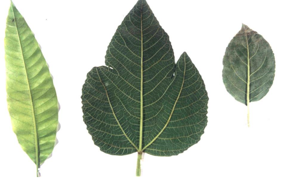
Fig. (2): Venation type in some investigated plants (obj. x 10. oc. x10).