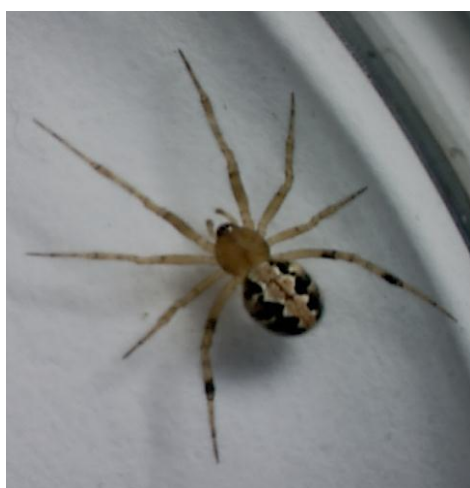
Fig. (2): Theridion incanescens Simon, 1890 adult female.