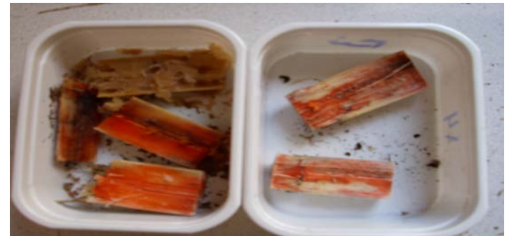
A-Second in star treatment chlorfenapyr