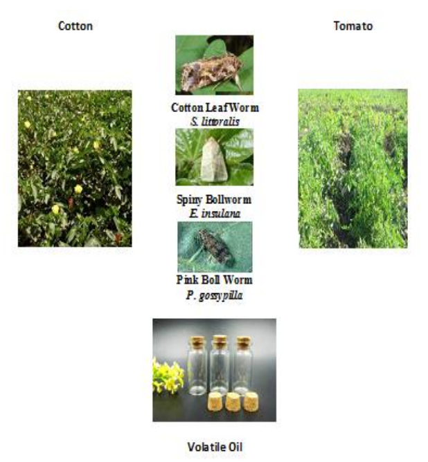
Fig. 1. Isolation and evaluation of cotton and tomato volatiles oils to major pests.

Spodoptera littoralis (Boisd.), estimated a positive response to cotton leaves about 76.6 %, the highest number of moths attracted were 80, 56.6 and 50 % by the tomato varieties "Bs", "Alissa" and "Real Madrid". Data in Table 3 showed that the number of S. littoralis females attracted were respectively 0.56 \pm 0.09 , 0.53 \pm 0.14 and 0.44 \pm 0.08 for "Real Madrid". "Alissa" and "Bs" of tomato varieties.