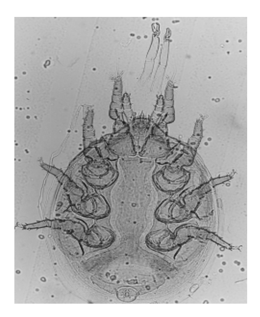
Fig. 1: Mites associated with the red palm weevil