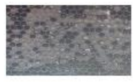
Fig. (3) EFB Symptoms.

By inspection the colonies, it was observed that two foulbrood diseases are found in some colonies without others, the inspection was mad within two steps, first by checkup of the diseased symptoms according to Shimanuki & Knox (1991) which belong to whether of the two diseases «Figs. 1, 2 and 3»