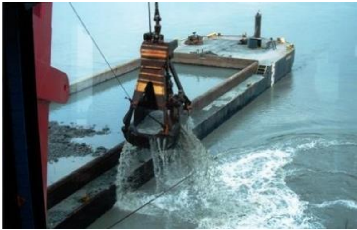
Figure 7- Dredged material being pulled out