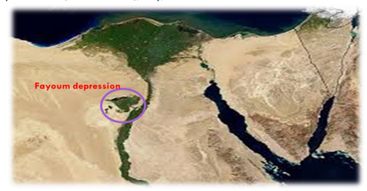
Figure 1- Satellite image of El-Fayum depression.

flows into Qarun and Wadi Al Rayan Lakes. The population of El-Fayum was about 3.8 million according to the population of the Arab Republic of Egypt for the year 2020.