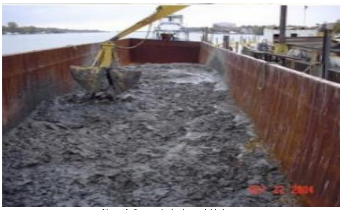
Figure 6- Storage dredged material in barge