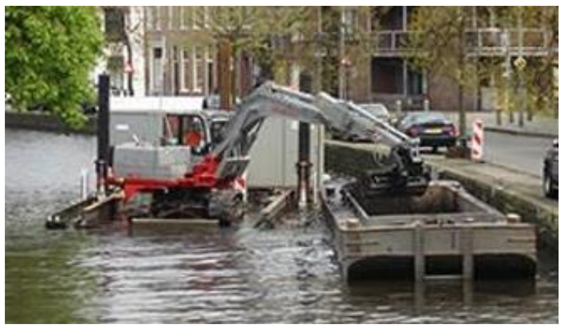
Figure 5- Excavator on a pontoon loading a barge