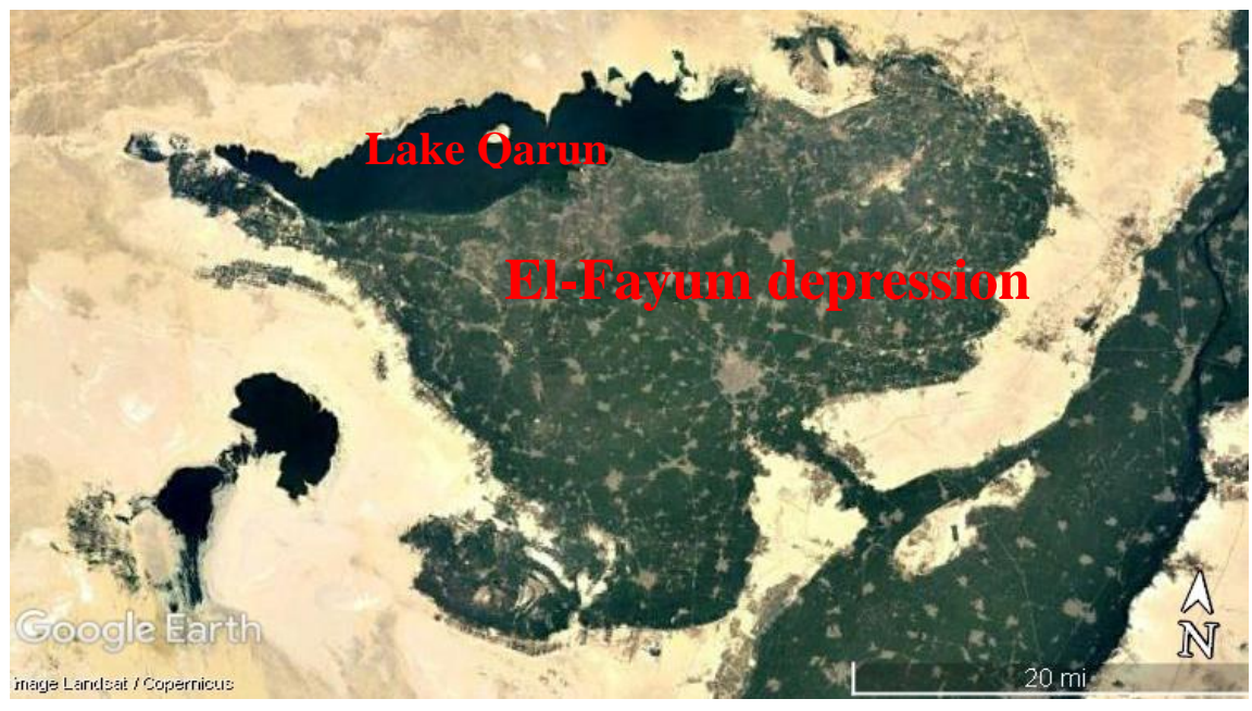
Figure 2- Satellite image of the lake Qarun and El- Fayum depression.