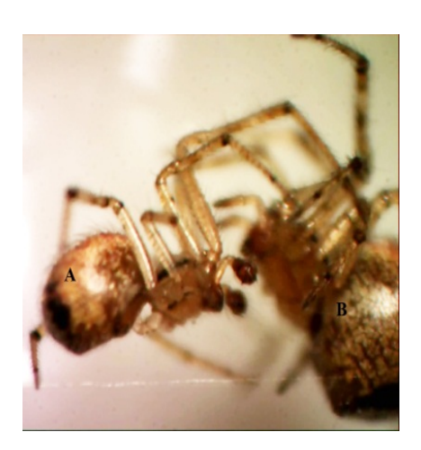
Fig. (2): Theridion spinitarse O. Pickard-Cambridge adult, A (Male) and B (Female).