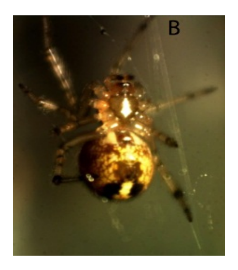
Fig. (1): Theridion spinitarse O.Pickard-Cambridge Adult. A (Male) and B(Female) ventral view.