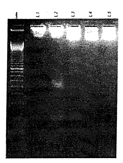
Fig (2): Gel electrophoresis of mice's kidney Fig (3): Gel electrophoresis of mice's liver

Ladder (DNA ladder), Lane (1): control, Lane (2): Ehrlich carcinoma tumor (ECT) DNA without treatment, Lane (3): ECT DNA with tannic acid treatment, Lane (4): ECT DNA with catechin treatment, Lane (5): ECT DNA with epicatechin treatment.