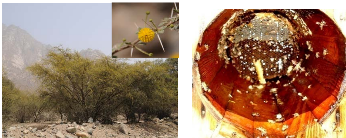
Fig (1). Comb honey in traditional hives and the flower of Salam tree in south region, KSA