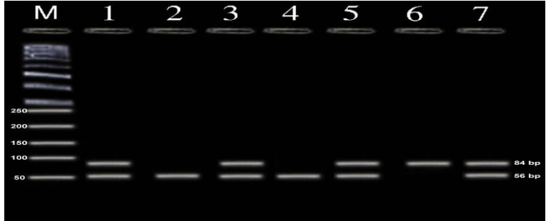
Figure (4): Enzymatic digestion of PCR product of A1298C polymorphism of MTHFR gene using Mob II enzyme. Mob II enzyme digests the 163 b.p fragment of the mutated type CC into 84, 31, 30 and 18 b.p fragments, while the wild type AA yields five fragments 56, 31, 30, 28 and 18; the small fragments (18, 28, 30, 31 b.p) have run off the gel. Lane M: DNA marker (50 b.p), lanes 2, 4 (wild type AA), lanes 1, 3, 5 and 7 (heterozygous mutated genotype AC which has 84, 56, 31, 30, 28 and 18 b.p fragments) and lane 6 (homozygous mutated genotype CC)