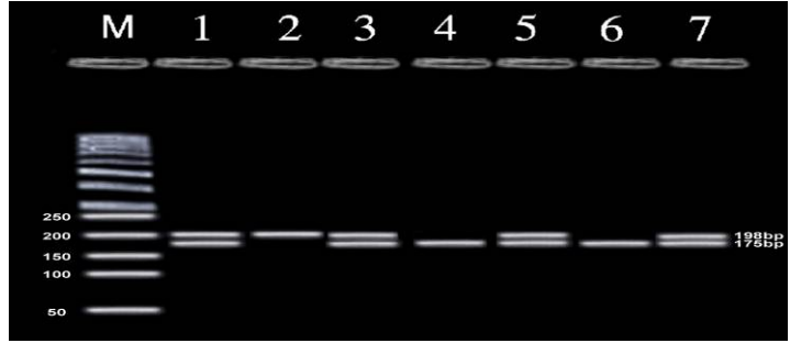
Figure (3): Enzymatic digestion of PCR product of C667T polymorphism of MTHFR gene using HinfI enzyme. HinfI enzyme digests the 198 b.p fragment into 175 and 23 bp fragments; the small 23 bp fragment has run off the gel. DNA marker (50 b.p), lane 2 (wild type CC is found which appears at 198 b.p), lane 1, 3, 5 And 7 (heterozygous mutated genotype CT which has 198, 175, 23 b.p fragments) and lane 4 and 6 (homozygous mutated genotype TT is found which has 175, 23 b.p fragments).